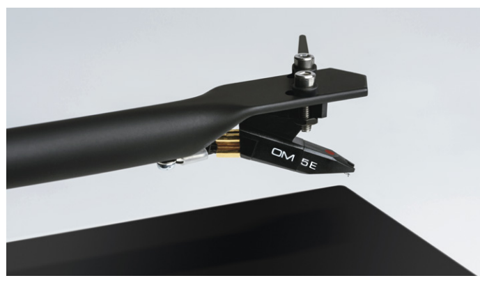
High-quality Ortofon OM 5E Moving Magnet cartridge with elliptical stylus tip

The T1 is a new affordable marvel. Still made in Europe by a turntable factory with decades of experience, it is a true hi-fi turntable that looks and sounds sublime.