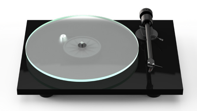
Superb build-quality, stylish looks and audiophile sound Precision CNC'd plinth and heavy zero-resonance glass platter

The stylish CNC-machined plinth, available in High Gloss Black, Satin White or Walnut finish, features no plastic parts and is carefully manufactured to ensure there are no hollow spaces inside, therefore avoiding unwanted vibrations within the chassis.