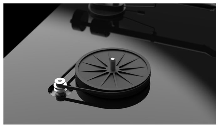
Ultra-precise motor and sub-platter design Lowest noise with immaculate speed stability

In the T1, the motor drives a belt-system, attached to a newly designed sub-platter, which is mounted into an ultra-precise 0.001mm main bearing with a hardened steel axle and brass bushing – just like our coveted Essential III turntables.