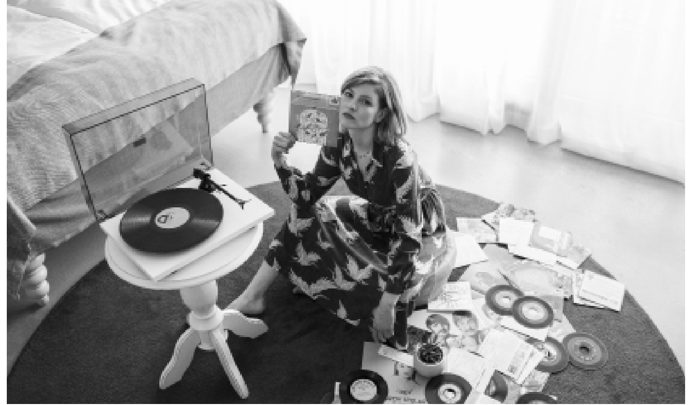
No corners cut! Audiophile engineering. No plastic. More sound.