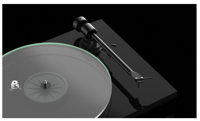
One-piece aluminium tonearm Robust and stiff construction for pure sound fidelity

Alongside the chosen motor system, the T1 is therefore able to ensure a smooth, anti-resonant rotational platform for the tonearm and cartridge to ride across.